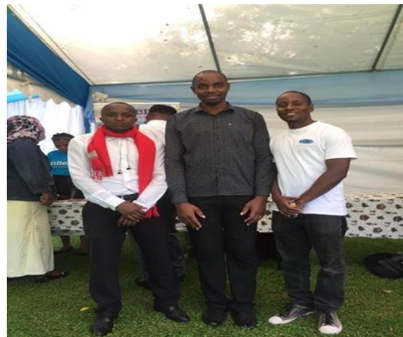
Figure 3 Some of the youth who volunteered on the international volunteer day