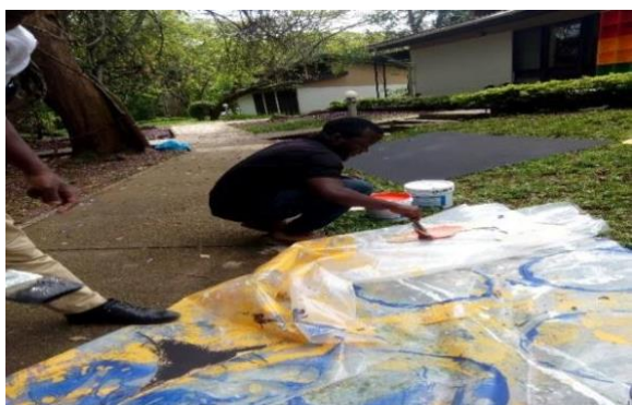
Figure 4 :One of VOYOTA volunteer in the preparation of YouLead summit at MS-TCDC