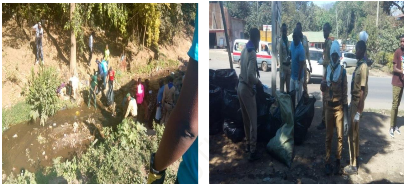
Figure 1 Cleaning activities taking place on the cleanliness day

The theme for the World Environment Day 2019 is "Air Pollution" . Air pollution is increasing day by day and it seems complex to control it but nothing is impossible we should come together to combat it. And for this it is necessary to understand different types of pollution, how it affects our health and environment will help us to take steps towards improving the air around us. We can't stop breathing but we can do something to improve the quality of air that we breathe.