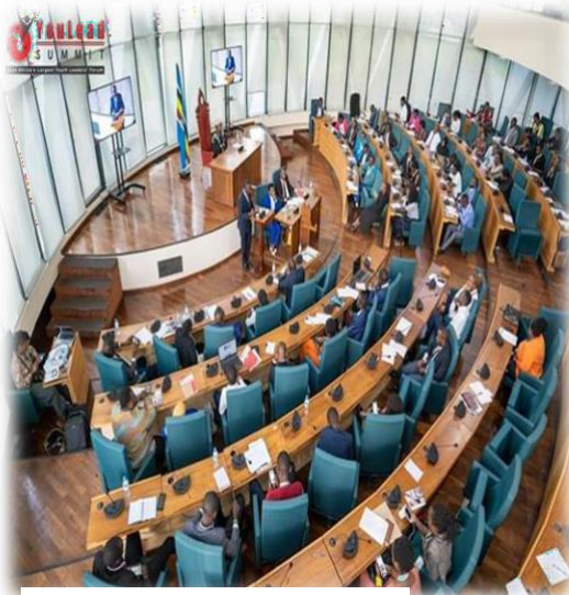
Figure 5 :EALA taking place at EAC.