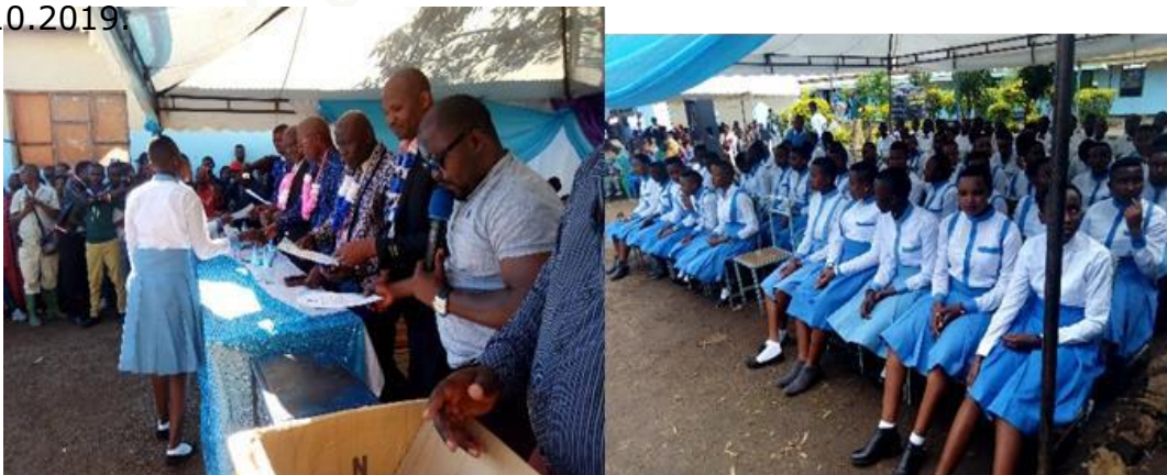
Figure 2 Certificates giving to UNAMBWE Secondary school club leaders

Also VOYOTA succeeded to provide the membership and leadership certificate to the form four girl's students on their graduation at Unambwe secondary school in the day of 19.10.2019.